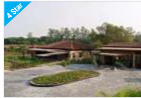
JEHAN NUMA RETREAT CLUB & SPA