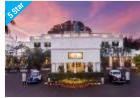
JEHAN NUMA PALACE